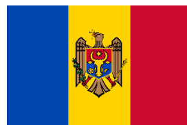
Moldova (Republic of)